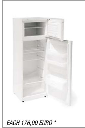
EACH 176,00 EURO *