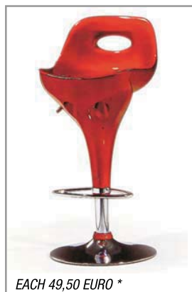
EACH 49,50 EURO *