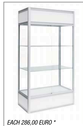
EACH 286,00 EURO *