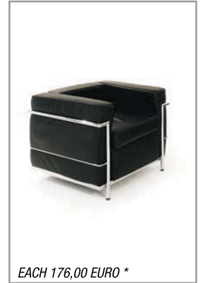
EACH 176,00 EURO *