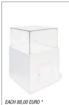
EACH 88,00 EURO *