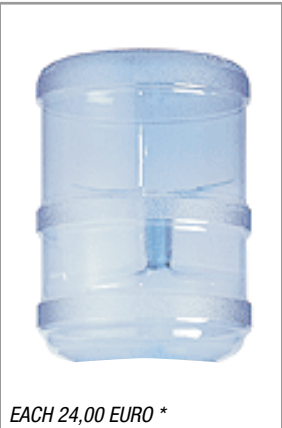
EACH 24,00 EURO *