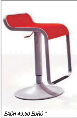
EACH 49,50 EURO *