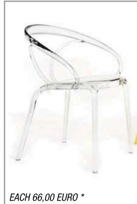
EACH 66,00 EURO *