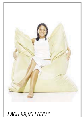
EACH 99,00 EURO *