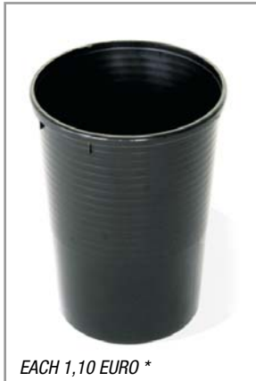
EACH 1,10 EURO *