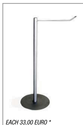
EACH 33,00 EURO *