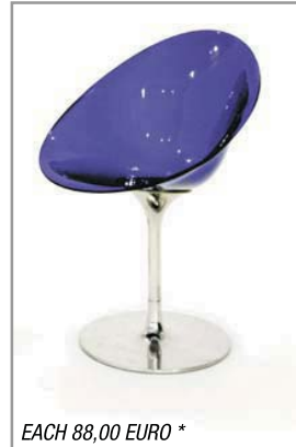
EACH 88,00 EURO *