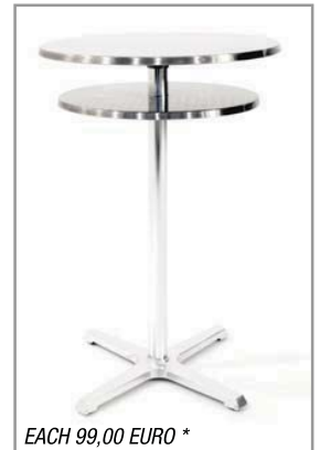
EACH 99,00 EURO *