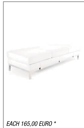
EACH 165,00 EURO *