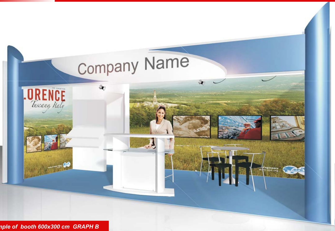
Example of booth 600x300 cm GRAPH B