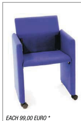
EACH 99,00 EURO *