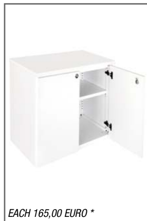
EACH 165,00 EURO *

(Included in pre-furnished Tiziano and Masaccio booths)