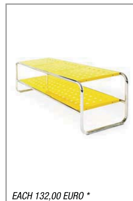
EACH 132,00 EURO *