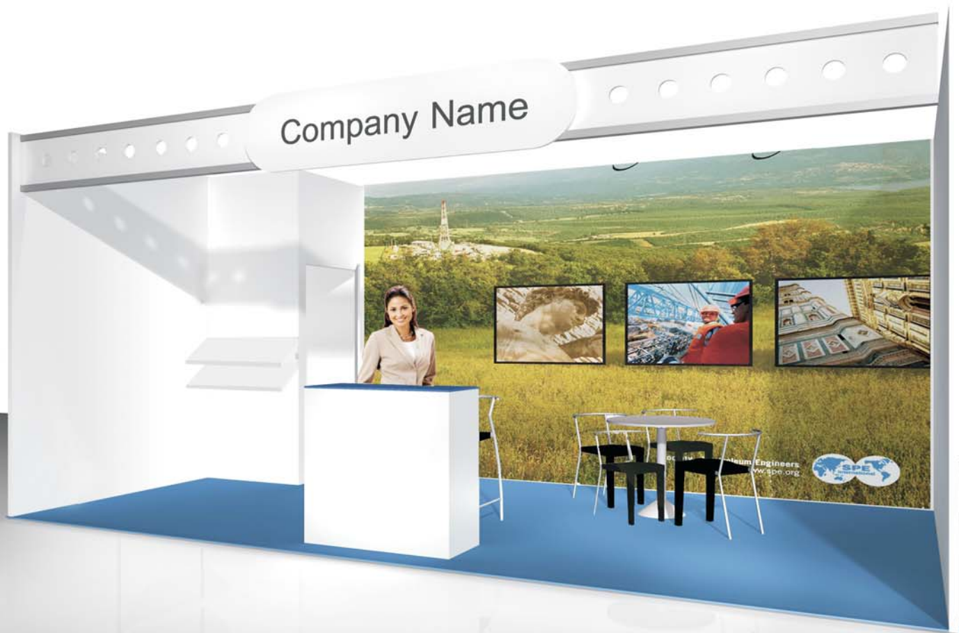
Example of booth 600x300 cm GRAPH A