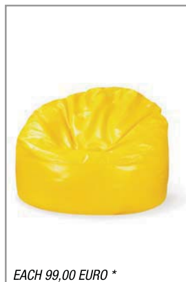
EACH 99,00 EURO *