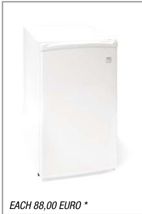
EACH 88,00 EURO *