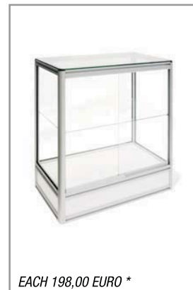
EACH 198,00 EURO *