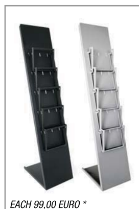
EACH 99,00 EURO *