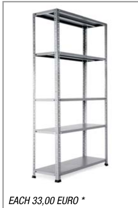
EACH 33,00 EURO *

(Included in pre-furnished Tiziano and Masaccio booths)