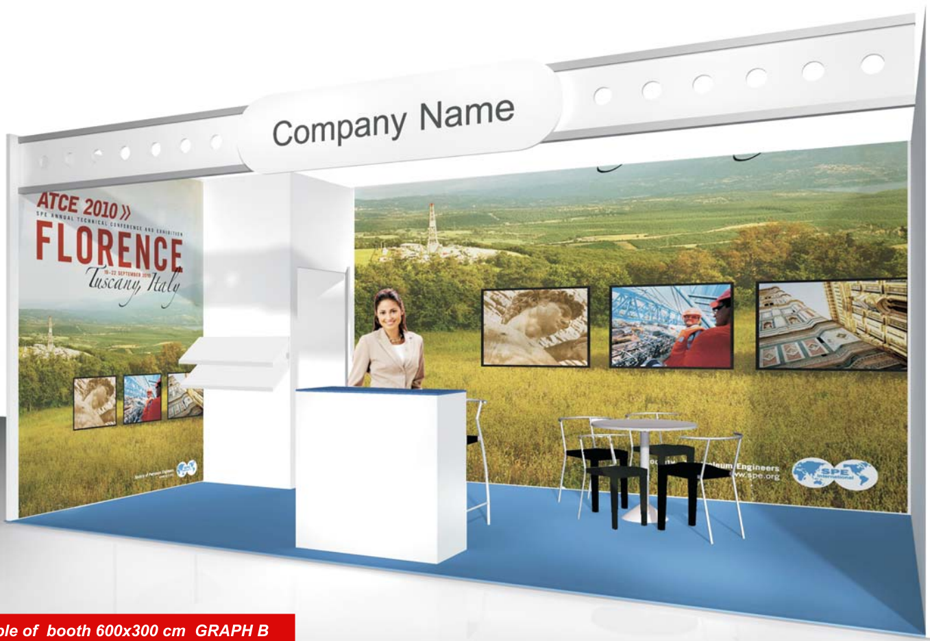
Example of booth 600x300 cm GRAPH B