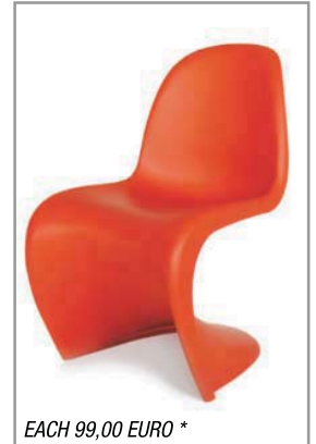
EACH 99,00 EURO *