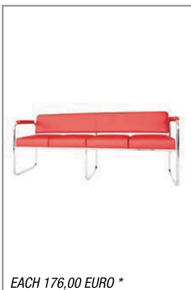
EACH 176,00 EURO *