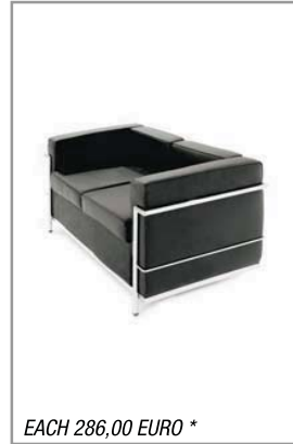
EACH 286,00 EURO *