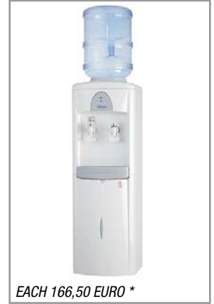
EACH 166,50 EURO *