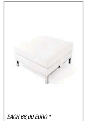
EACH 66,00 EURO *