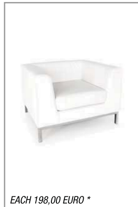
EACH 198,00 EURO *