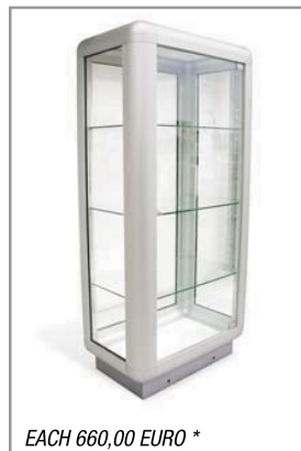
EACH 660,00 EURO *