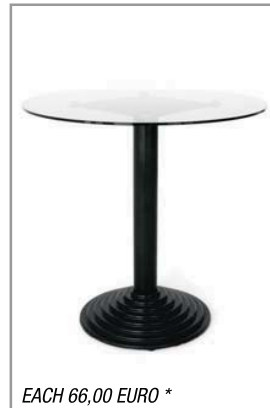
EACH 66,00 EURO *