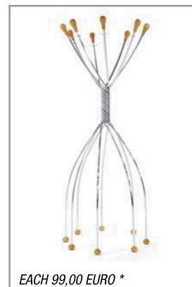
EACH 99,00 EURO *