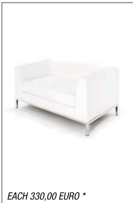
EACH 330,00 EURO *