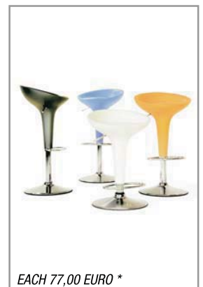
EACH 77,00 EURO *