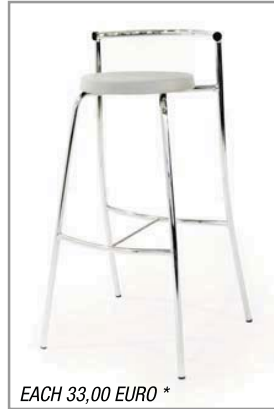
EACH 33,00 EURO *