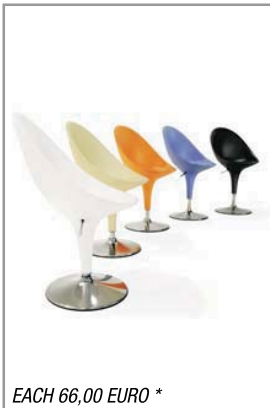
EACH 66,00 EURO *