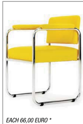
EACH 66,00 EURO *