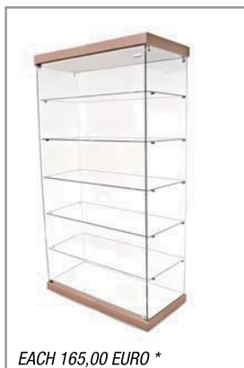
EACH 165,00 EURO *