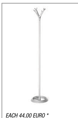
EACH 44,00 EURO *