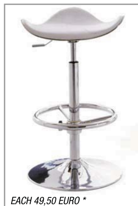
EACH 49,50 EURO *