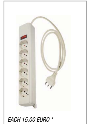
EACH 15,00 EURO *

(Included in pre-furnished Tiziano and Masaccio booths)