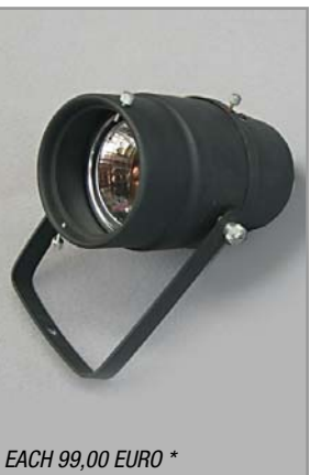
EACH 99,00 EURO *

(Included in pre-furnished Tiziano and Masaccio booths)