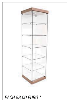
EACH 88,00 EURO *