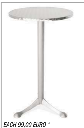
EACH 99,00 EURO *