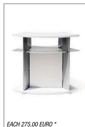
EACH 275,00 EURO *