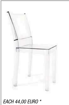
EACH 44,00 EURO *