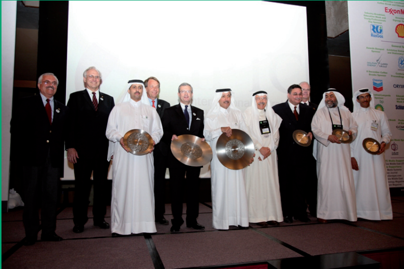
Previous Awards Ceremony (IPTC 2009)