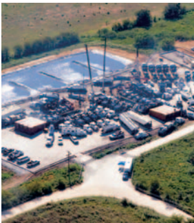
BJ's "simo-frac" technique has proved successful in horizontal wells in shale reservoirs. Here BJ crews frac three horizontal shale gas wells at once.

BJ Services earned its reputation for reliable shale gas fracturing in the Barnett Shale. We offer the most advanced fracturing technologies – the right fluids, proppants and equipment needed to “crack the code” for shale frac designs and operations. Our shale fracturing leadership has helped prove the economic viability of Barnett Shale wells.