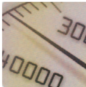
Highest pressure: 30,440 psi (210 MPa) LWD world record Gulf of Mexico, 2006

Building a better well takes better data. Data you can count on, even at 30,000 psi. Data that is accurate, even at 193°C. Building a better well means record setting, field proven results in ultra-deep, high-angle, short-radius, extended-reach, HPHT or any other challenging application. For more information, contact Paul Radzinski at 281.260.5652 or e-mail routinetoextreme@weatherford.com . If you’re ready for the world’s most advanced LWD, you’re ready for Weatherford.