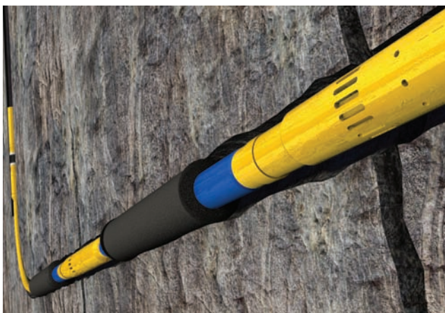
Fig. 1—RE packers and frac sleeves used in a cementless multistage completion design.

With new, noncement isolation methods, it is possible to achieve uniform flow in highly productive wells, perform multiple fracture treatments in carbonate and shale reservoirs, and employ inflow control devices (ICDs) to manage flow without well intervention. All of these capabilities extend a well's productive life and profitability.