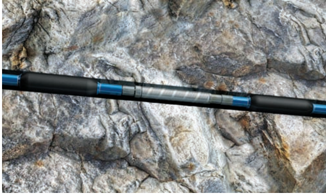
Fig. 3—Hydro/mechanical, composite packers deployed with ICDs.