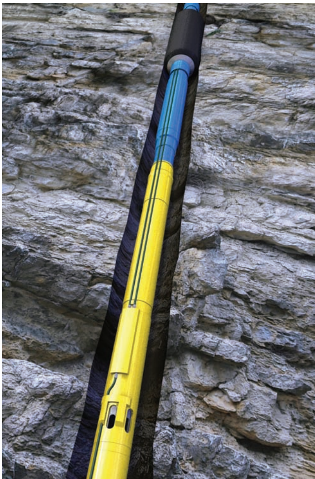
Fig. 2—Hydro/mechanical, composite packers deployed with IWS technology.

Testing indicated that the OBM would swell the RE packer, but to deploy the system successfully, a new retardant had to be tested. Used successfully to deploy the packers and frac sleeves, the retardant is now available for similar contingencies.