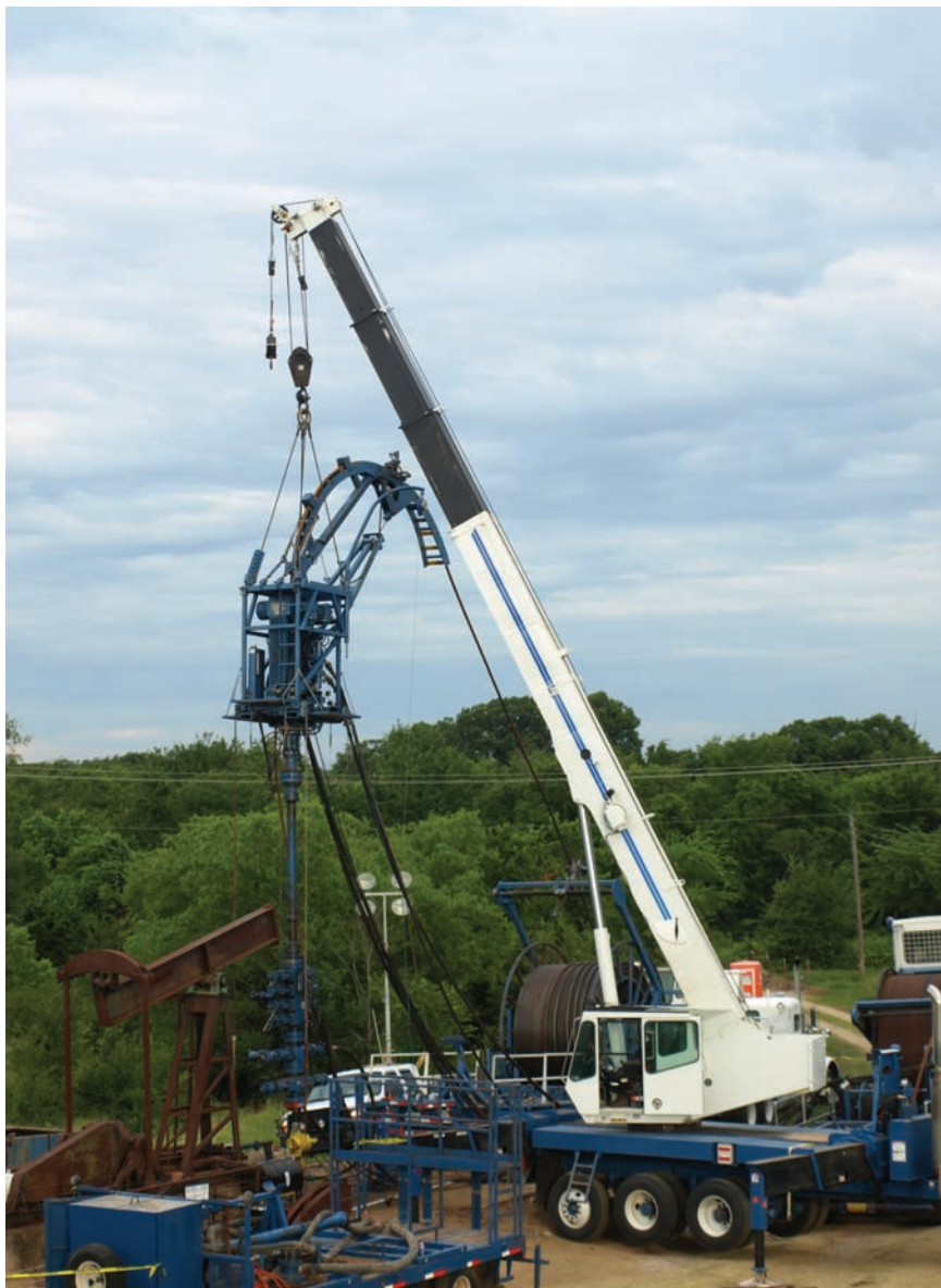
Fig. 3—The acid-tunneling tool was run on CT during a July 2008 operation that increased production from a well in Oklahoma.

Moss, P., Portman, L., Rae P., and di Lullo, G. 2006. Nature Had It Right After All!—Constructing a “Plant-Root”-Like Drainage System With Multiple Branches and Uninhibited Communication With Pores and Natural Fractures. Paper SPE