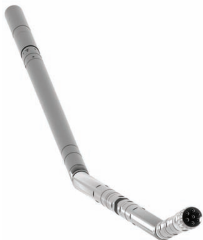
Fig. 1—The robust, acid-tunneling tool, patent pending, comprises two kickoff joints that simplify tunnel initiation and extension.

The patented process, called StimTunnel, uses coiled tubing (CT) to convey a jointed nozzle that jets acid at the formation rock, dissolving it to create numerous mechanically stable, stimulated tunnels into the formation ( Fig. 1 ). These tunnels, and the multitude of wormholes and expanded pores, increase reservoir contact and improve productivity by distributing inflow across more surface area (Rae and di Lullo, 2001).