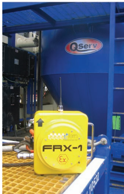
Fig 8—Fern Communications' FRX-1 ATEX radio repeater.

E&P disciplines across domain processes. It connects solutions through data-rich models and advanced geosciences technology, and it covers survey and repository boundaries for all domains across distributed-data models and third-party data. E&P teams can improve reservoir-property models through continuous correlation, calibration, and correction, refining and expanding the asset-knowledge base.