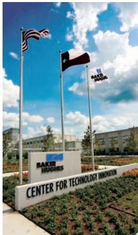
Center for Technology Innovation (CTI)