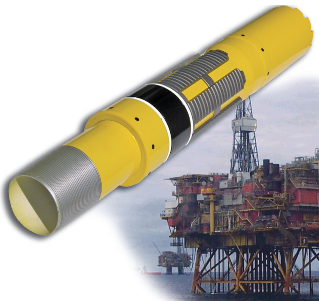
Fig. 1—The TORXS Expandable Liner Hanger System.

The tool combines several proven technologies in one reliable multilateral junction with selective, high-pressure fracturing capabilities. Each separate component is a time- and cost-saving product on its own; in this combined form, they offer a stimulation system that improves initial productivity, accelerates reservoir drainage, and provides faster return on investment.