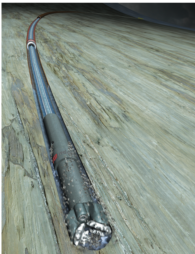
Fig. 2—The Reelwell Drilling Method.

The system not only improves crude/saltwater separability, but it reduces the freshwater requirement and lowers demulsifier spend. The ProSalt is a compact, flange-mounted