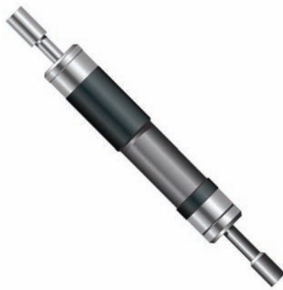
Fig. 4—TAM TripSAVR for testing blowout preventer and riser connections.