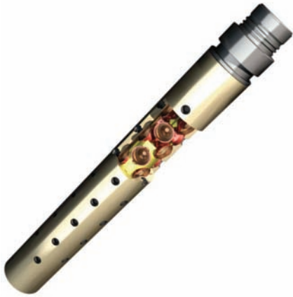
Fig. 3—Halliburton’s 7-in. ultra-high-pressure perforating gun.