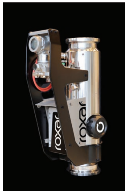
Fig. 7—Roxar’s MPFM 2600 multiphase meter.

Third-Generation Multiphase Meter —Roxar ASA launched its third-generation MPFM 2600 multiphase meter ( Fig. 7 ) based on its Zector Technology. The meter’s new field electronics, electrode arrangements, and voxel-based signal processing provide higher accuracy than was available previously. The new technology allows 12,000 measurements per second for simultaneous flow-sector investigation. The technology enables an accurate