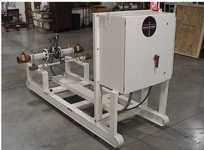
Fig. 6—Universal Well Site Solutions’ UniSkid wellsite manager.

ogy without reducing the rate of penetration (ROP). The company’s XPS expandable stabilizer can be used above the reamer to increase drilling efficiency by eliminating collar whirl for higher ROP with lower WOB. Operators can drill and ream simultaneously, or can enlarge a previously drilled pilot hole. The blade motion—angled radially outward and upward—is a fail-safe measure to ensure cutter-blade retraction. The company’s Genesis polycrystalline-diamond-compact cutters address challenging drilling applications. The one-piece body is constructed from a high-tensile-strength fatigue-resistant material. Proprietary hard-faced interchangeable wear pads eliminate heat-affected zones and crack propagation. Strategically placed interchangeable nozzles for each cutter blade improve cuttings removal and transport.