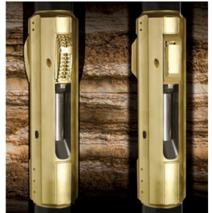
Fig. 5—Hughes Christensen’s GaugePro XPR expandable reamer, left, and GaugePro XPS expandable stabilizer, right.

ment surface to provide a strengthened charge between the particles to align the proppant pack. Fines control is achieved in the same manner. When formation particles are treated with the solution, the zeta potential of the fines is altered to promote an environment of agglomeration. The potentially production-damaging particles are fixed in place without restricting production flow. The chemistry of the package leaves the formation less hydrophilic and in the optimal wetted condition, which helps to increase load recovery and gas production.