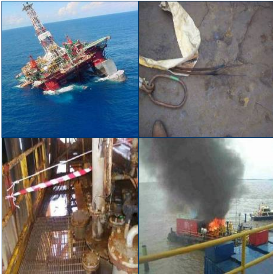
Lost-Time Injuries and Illnesses