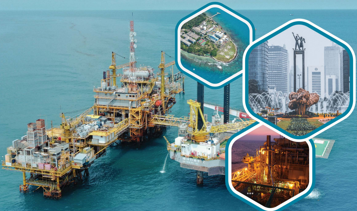
Exhibit Prospectus and Sponsorship Opportunities