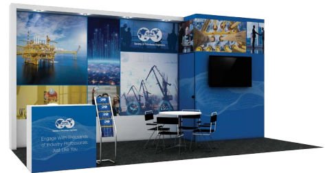
Sample of 18 sqm display style exhibition booth (Premier Package)