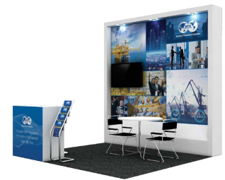
Sample of 9 sqm display style exhibition booth (Enhanced Package)