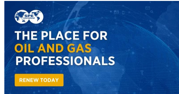
Renew for 2024 Video