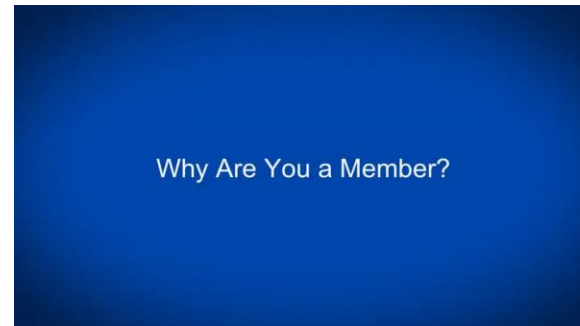
Join. Renew. Belong Video