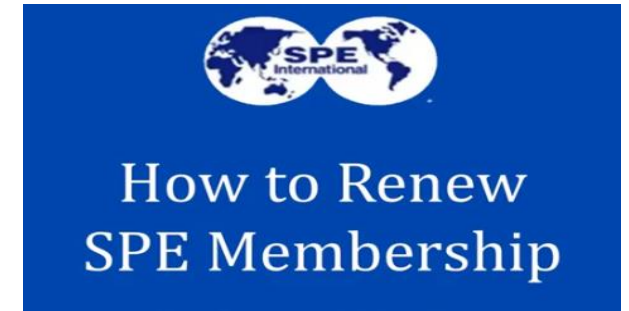
Renew Student & Renew Professional