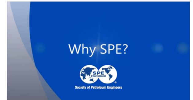
Why SPE? Video - 40-Year Member